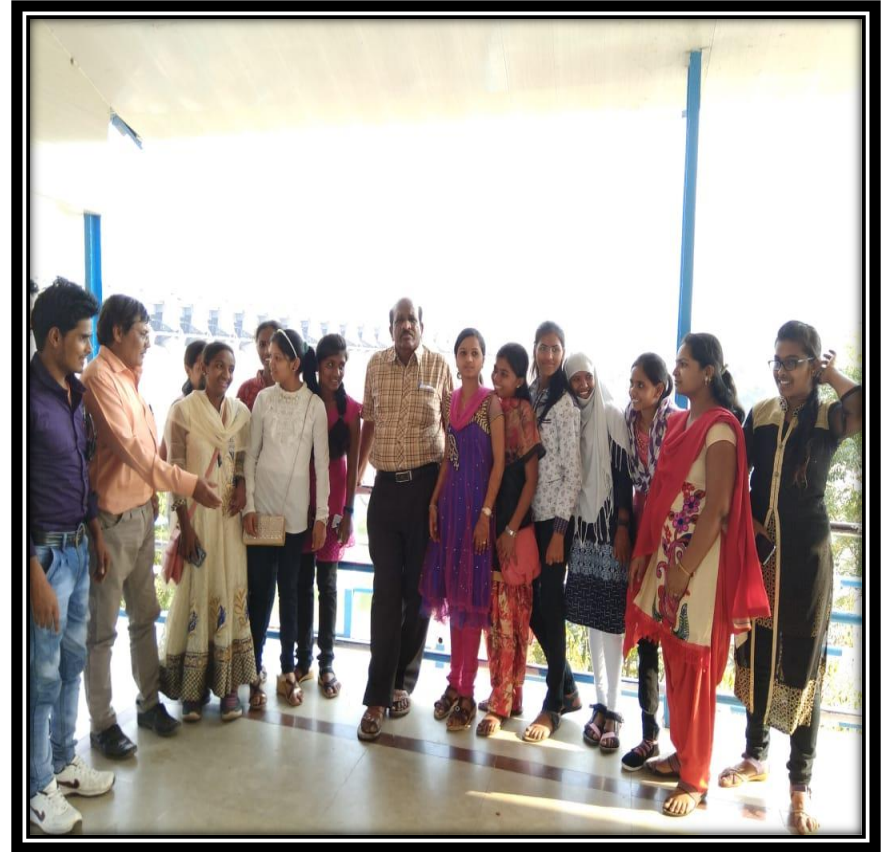
Students Visit to Narmada Sarovar