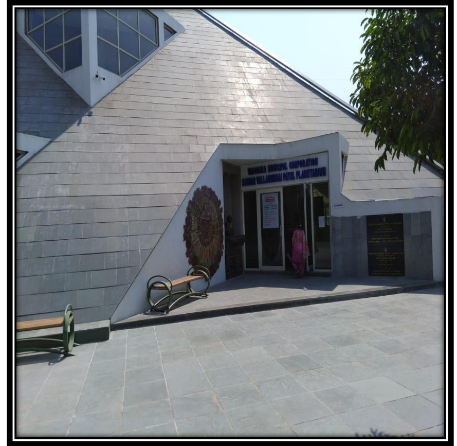
Students Visit to Kuber Bhandar Temple and Patel Planetarium in Badoda