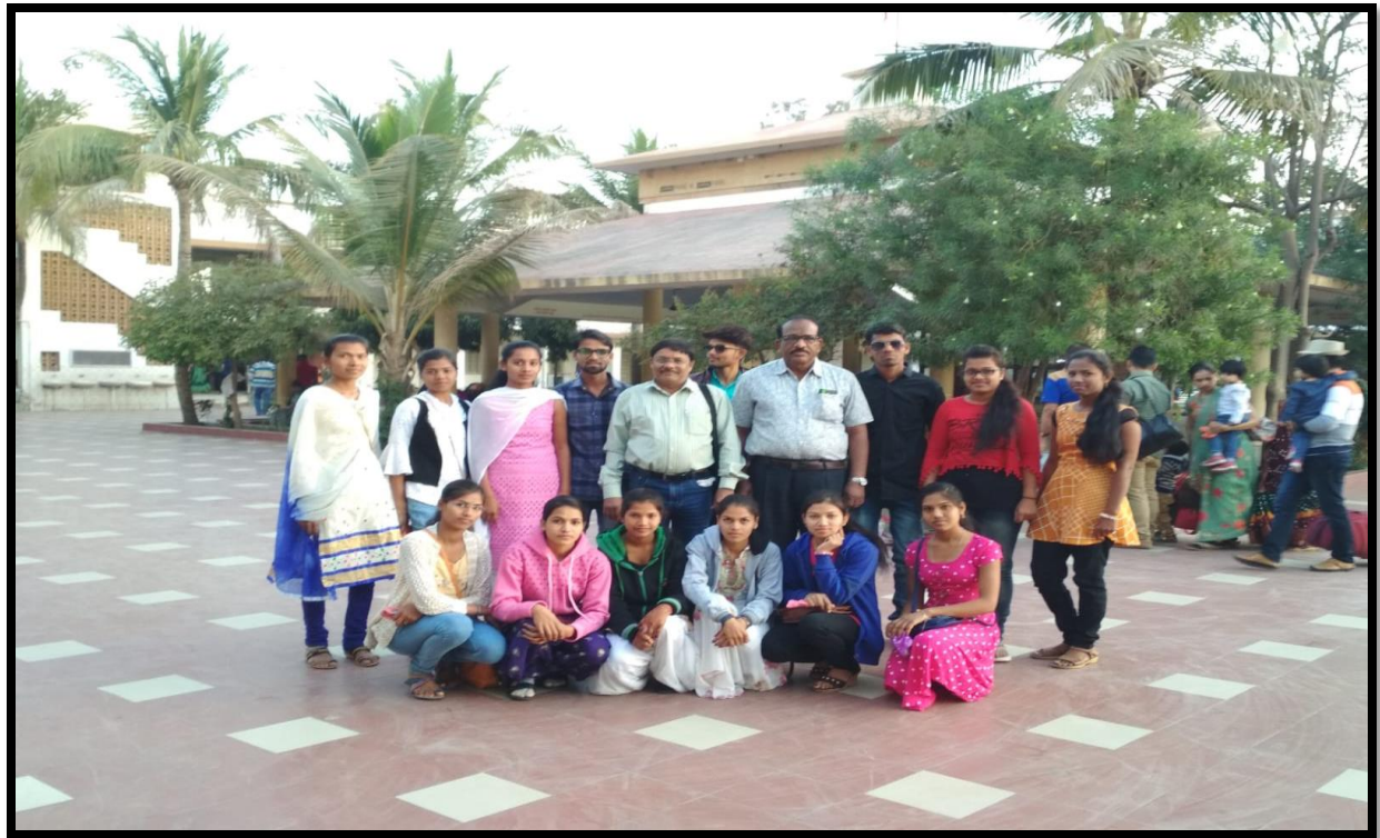
Students Tour Visit to Ambaji