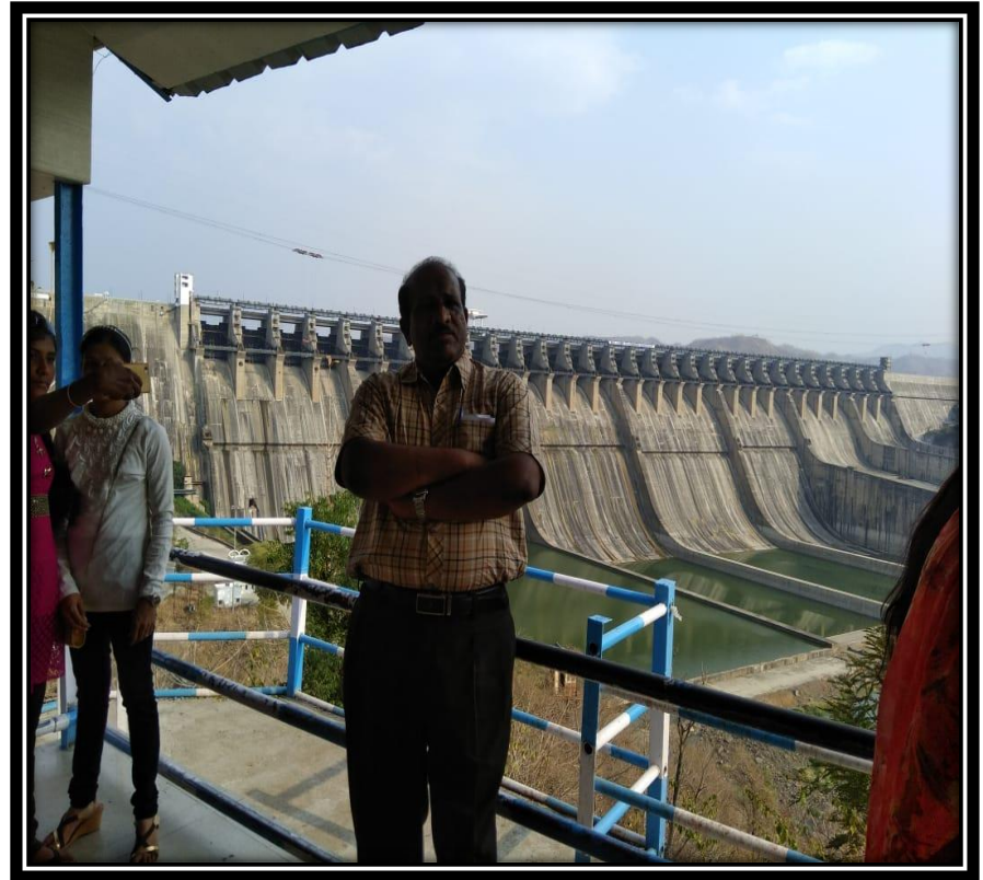
Students Visit to Narmada Sarovar