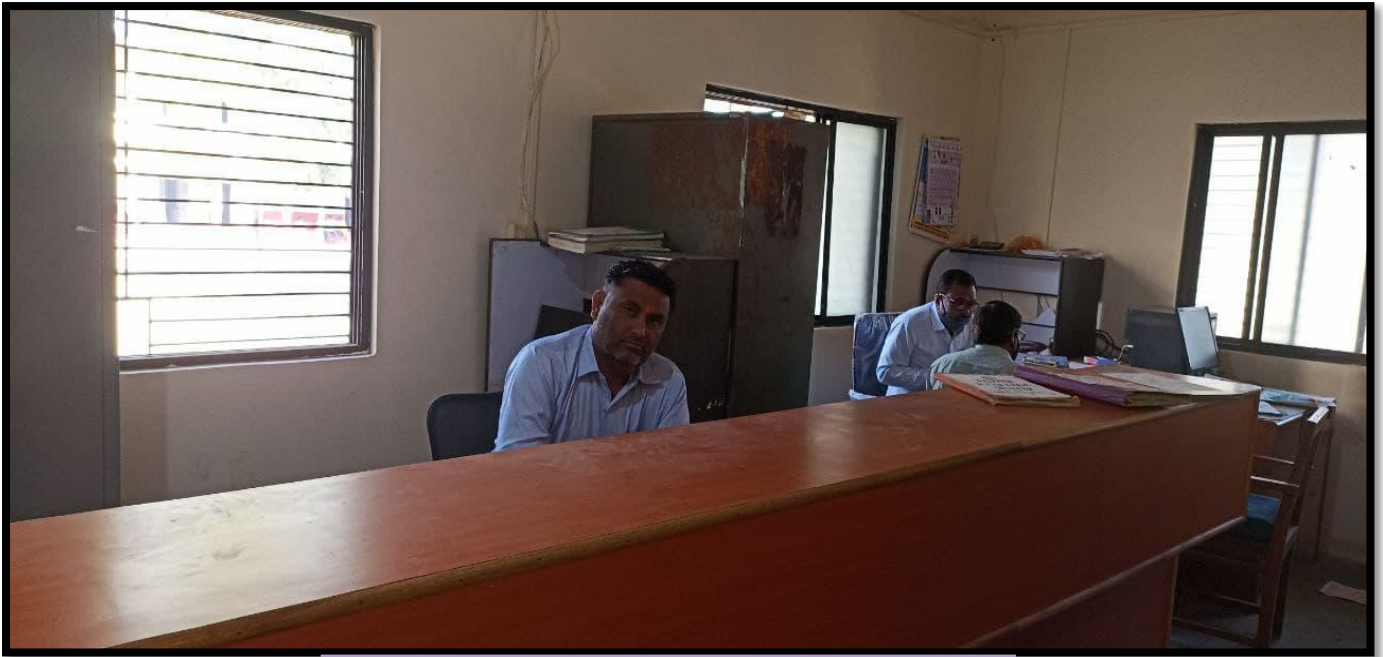
Office Superintendent and Finance Section