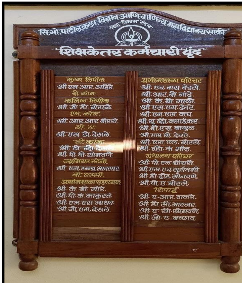
Composition of Office Staff and Departments