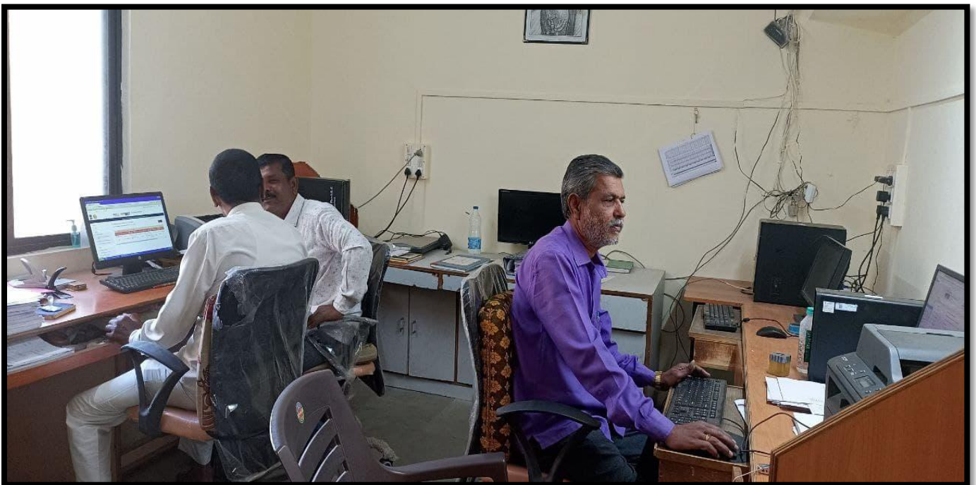
Scholarship, University, Govt. Reports, Documentation and Legal Section