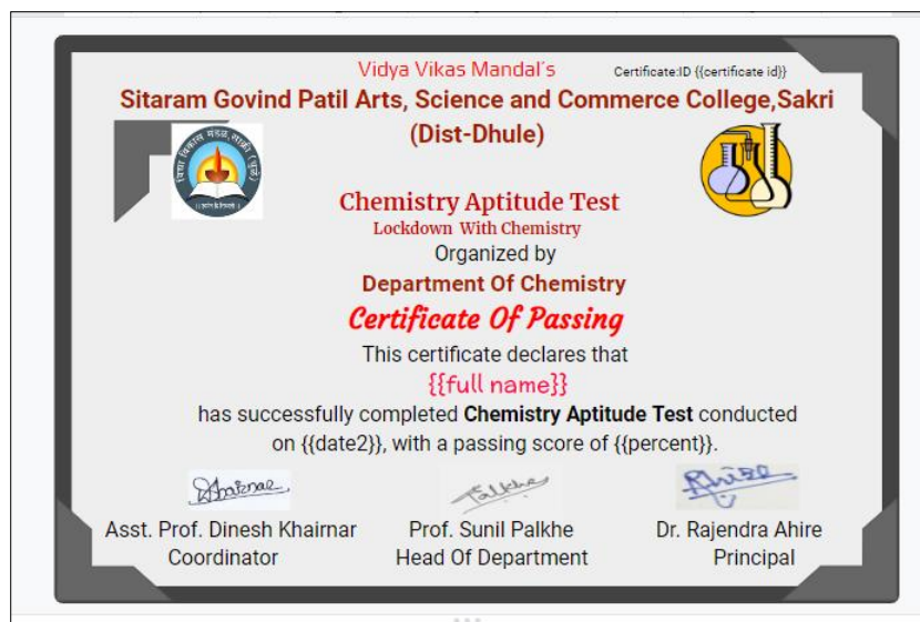
Sample of Chemistry Aptitude Test Certificate